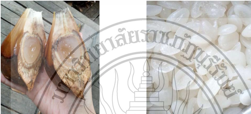
Figure 1. Nipa endosperm

3.1.2 The study of the proximate composition and chemical properties of fresh nipa endosperm