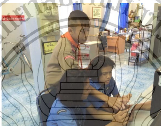
Figure. Lessons learned through electronic media, almost chocolate.

In order to assess the satisfaction and student satisfaction with the management model of learning, interactive learning knowledge through media tablet developed.