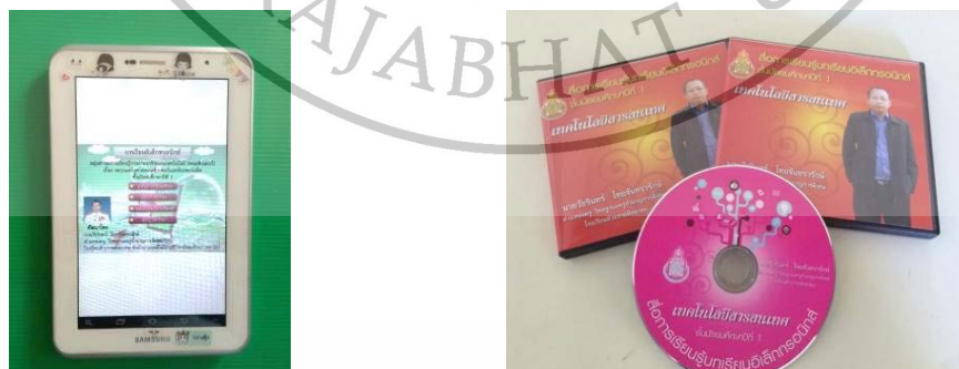
Figure 2. Learning E-learning through the media tablet

Any suggestions on bringing research results to the introduction of interactive learning to build knowledge through media tablets to teachers must refer to the manual, interactive learning creates knowledge. Knowledge of media tablets to take and implement learning activities, as noted, to achieve understanding and confidence in teaching. Which makes teaching each objective.